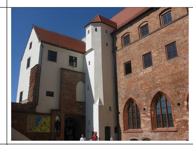
8. Darłowo – The Pomeranian Dukes' Castle – Tomasz Duda sources