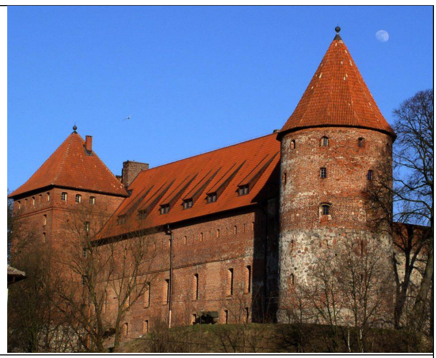
6. Bytów – The Castle, Gothic Tower and Museum