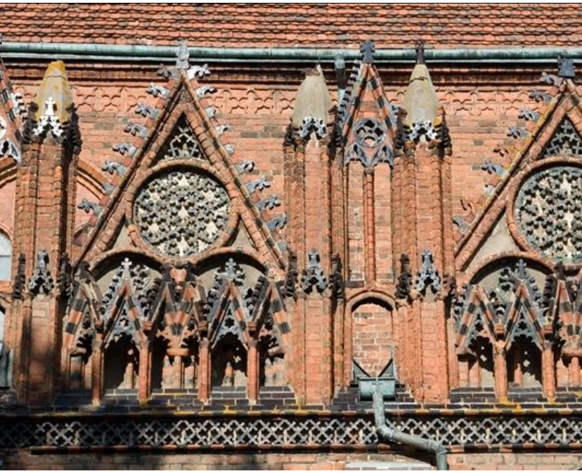
Marshal Office sources