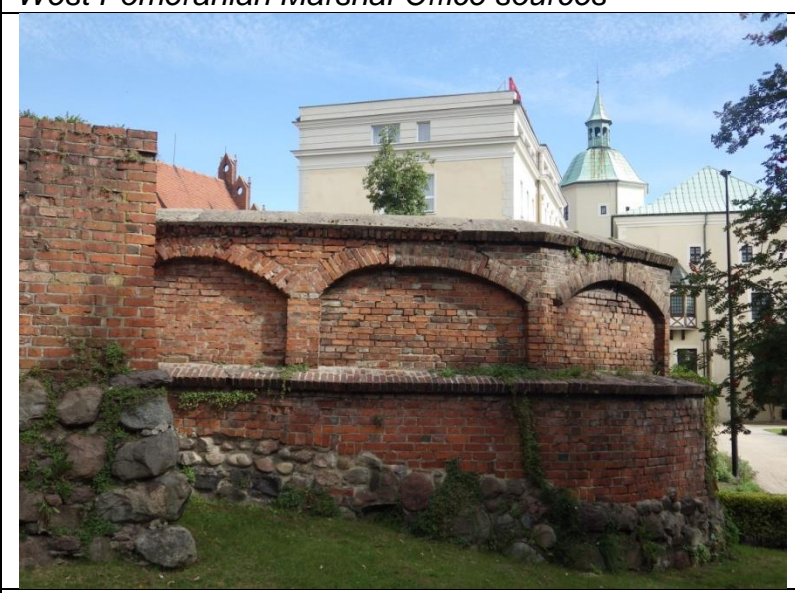
7. Słupsk- The Pomeranian Dukes' Castle -Museum of Central Pomerania in Słupsk