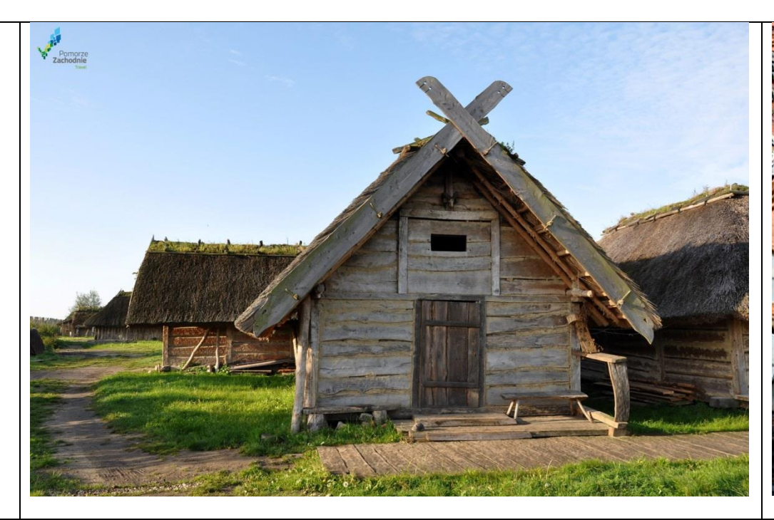
2. Center of Slavs and Vikings in Wolin - West Pomeranian Marshal 3. Kamień Pomorski – The Cathedral - West Pomeranian Office sources