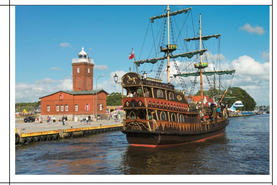
9. Darłówko – District of Darłowo, sunbathing and lighthouse