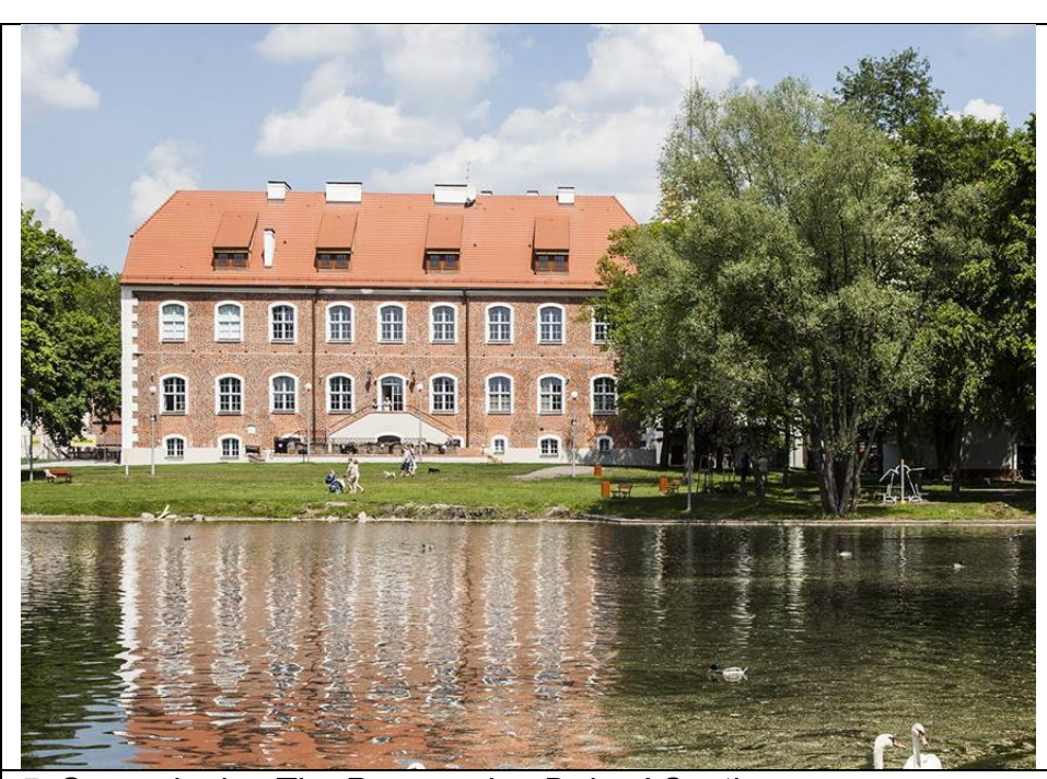
5. Szczecinek – The Pomeranian Dukes' Castle