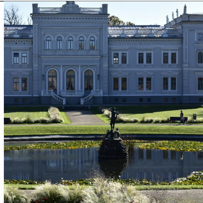
8. Plunge Palace