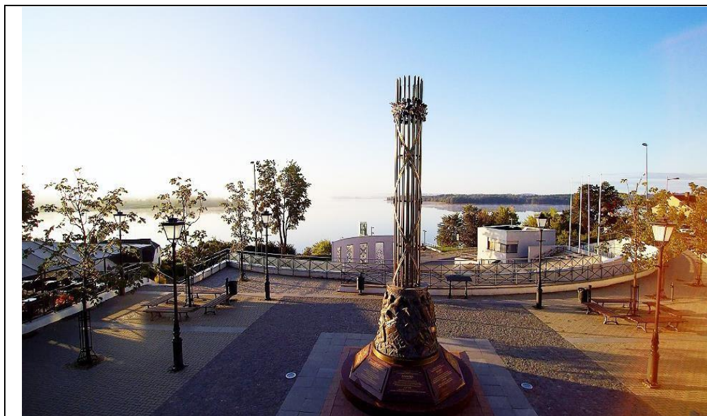
5. Amphitheater square in Telsiai