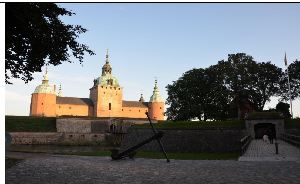
6. Kalmar Castle, Sweden, Rita Dizaviciene