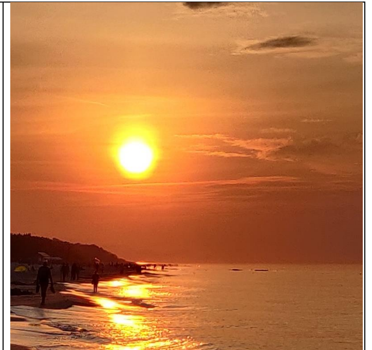
11. Sunset in Karwia Beach