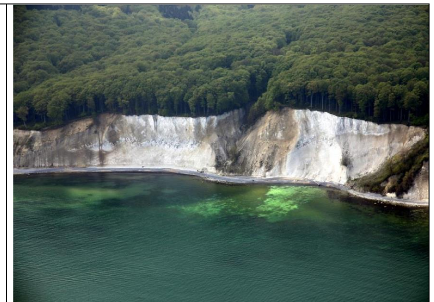
7. The White Cliff, Rügen island, Freddie Bijkerk