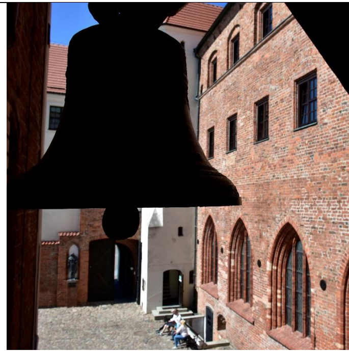
9. Alert Bell at Darłowo Castle