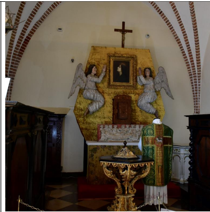
10. Chapel in Darłowo Castle